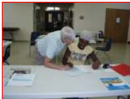
GED students preparing for final exam

Beginning September 25th, in partnership with TAP-This Valley Works, Adult Literacy and a second Adult GED class will be held from 2 p.m.— 6 p.m.