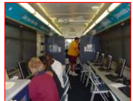
Individuals exploring eBus

reports were printed, reviewed and given to individuals; 42 one-on-one financial literacy counseling sessions were held and 2 applications were filled out by visitors to the eBus.